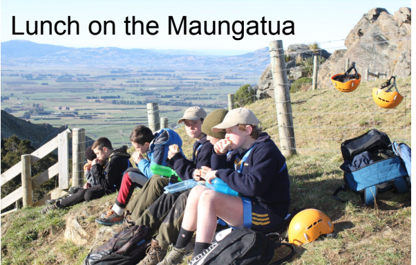
Lunch on the Maungatua